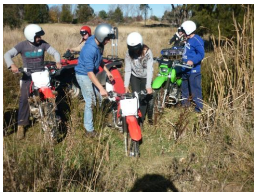
Students working together to get out of the creek

Students have also been fencing at Anson St farm. This provided students with the opportunity to gain valuable skills including sighting the line of a fence, attaching and straining wire to construct an entire fence.