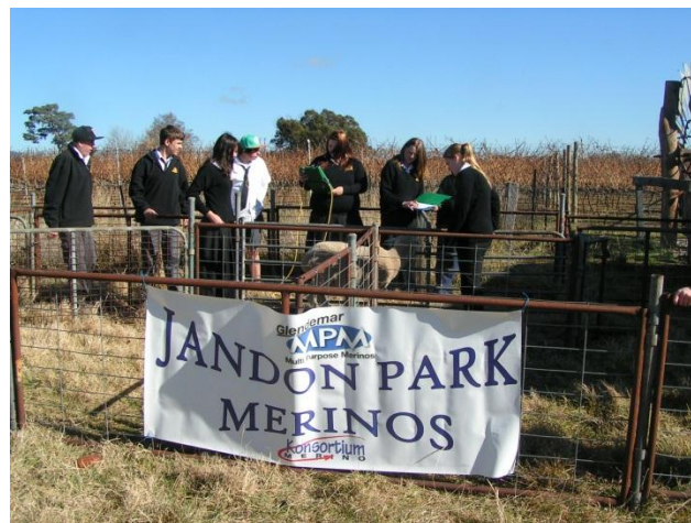
Students weighing the new sheep at Anson Street Farm