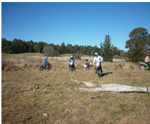
Students navigating through obstacles as part of their training