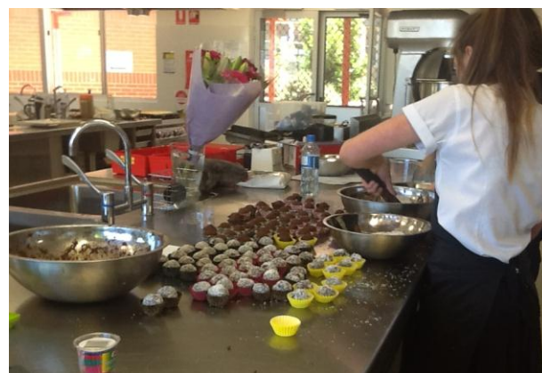
Achievement in a supportive environment