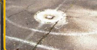
Orange High School Basketball/netball Court 2015

The winner will be drawn on Friday 4 th September.