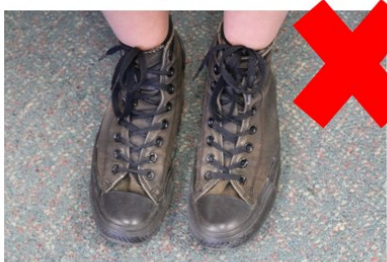
CONVERSE HI TOPS