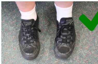
ENCLOSED BLACK LEATHER SHOES