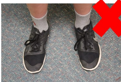
SNEAKERS / SKATE SHOES