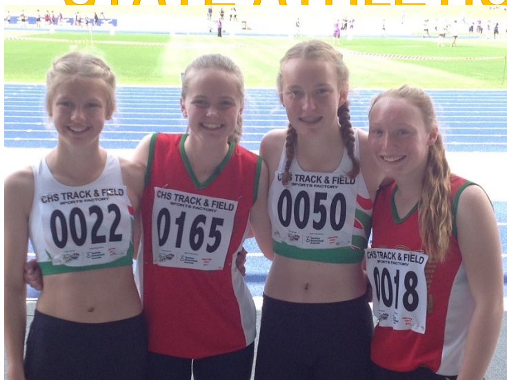
Under 14s State Relay 2016 finalists

The boys and girls relay teams had a wonderful time. They represented the school very proudly and gave each other such lovely support and encouragement - great displays of sportsmanship. What a fantastic group of athletes the school has in this age group!