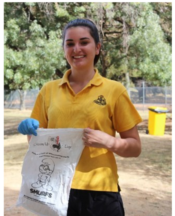
Year 10 students spent their morning cleaning the school grounds last Friday 3 rd March, as a part of the Clean Up Australia Day.