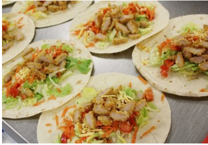
Warm Chicken Tender Wraps $4.00