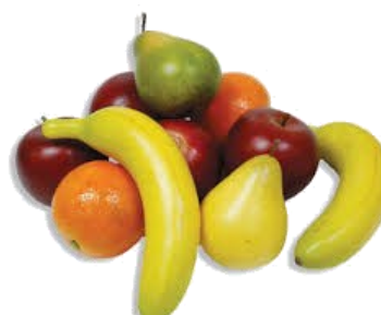
Fresh fruit $ 0.50 a piece