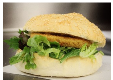
Chicken Burger $4.00