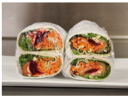
Salad Wrap $3.50