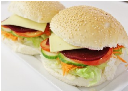
Salad Roll $3.50