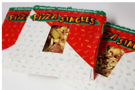
Pizza Singles $2.00