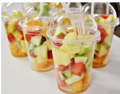
Fruit Cups $3.00