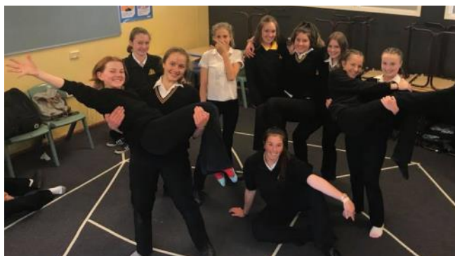
Year 9 dance class playing around with Shapes in Space